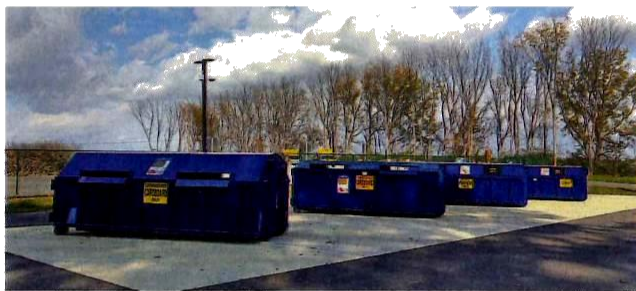
Drop-Off Recycling Center outside the fence.