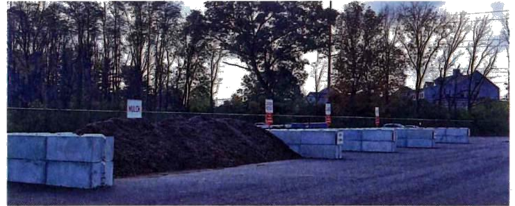
(from LEFT to RIGHT) 1) Mulch 2) Garden Residue 3) Leaves 4) Brush